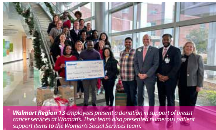
Walmart Region 13 employees present a donation in support of breast cancer services at Woman's. Their team also presented numerous patient support items to the Woman's Social Services team.