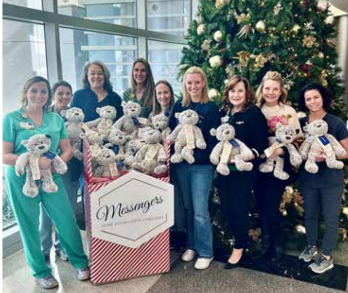
Messengers Gifts donated 500 Giving Bears during the holiday season for the babies in the Woman's NICU.

Your contributions have a meaningful impact.