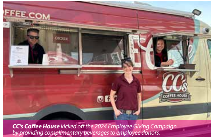
CC's Coffee House kicked off the 2024 Employee Giving Campaign by providing complimentary beverages to employee donors.