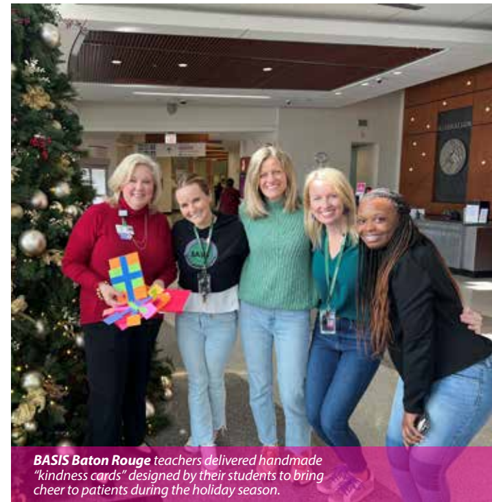
BASIS Baton Rouge teachers delivered handmade "kindness cards" designed by their students to bring cheer to patients during the holiday season.

You can get involved and support Woman's. To host a fundraising event or join an event committee, email giving@womans.org .