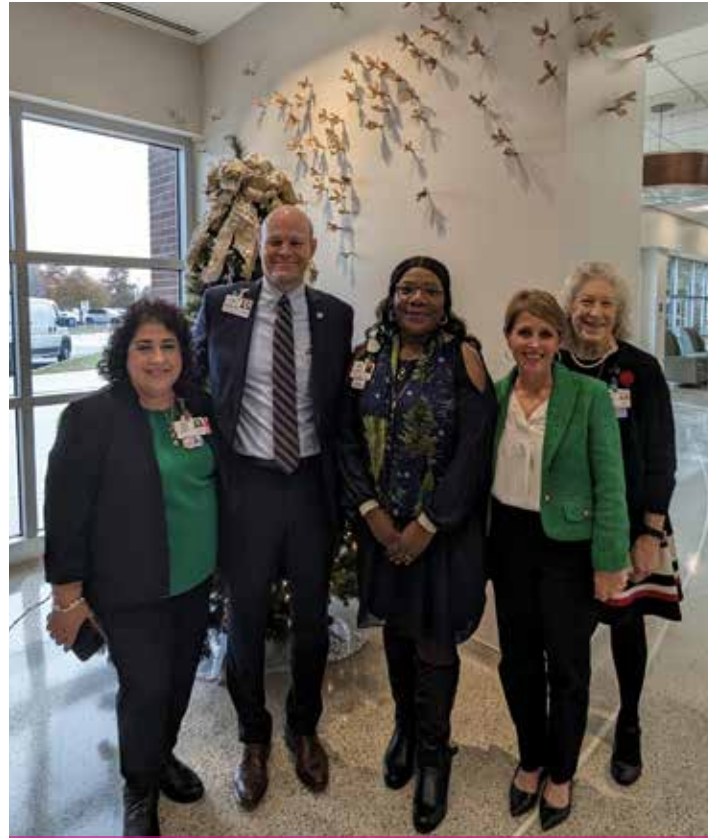
The Woman's Cancer Pavilion began the holiday season with its annual Christmas tree lighting.